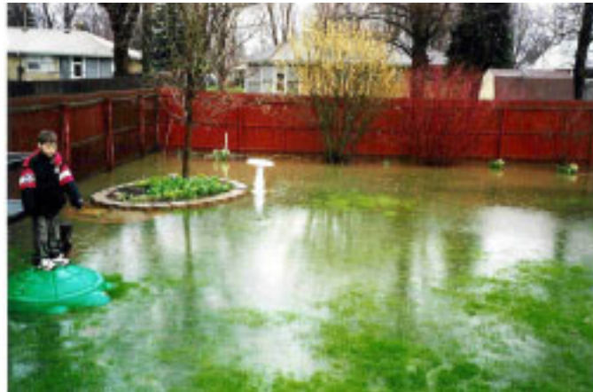
This photo of the backyard of a North Tonawanda, NY home, built in a portion of the Klydel wetland shows why its better to preserve wetlands than to build in them.

Wetlands store flood water and release it slowly. In this way wetlands function to: